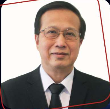
H.E. PAN Sorasak Minister Ministry of Commerce Royal Government of Cambodia